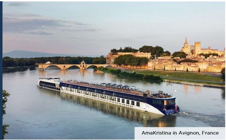
AmaKristina in Avignon, France